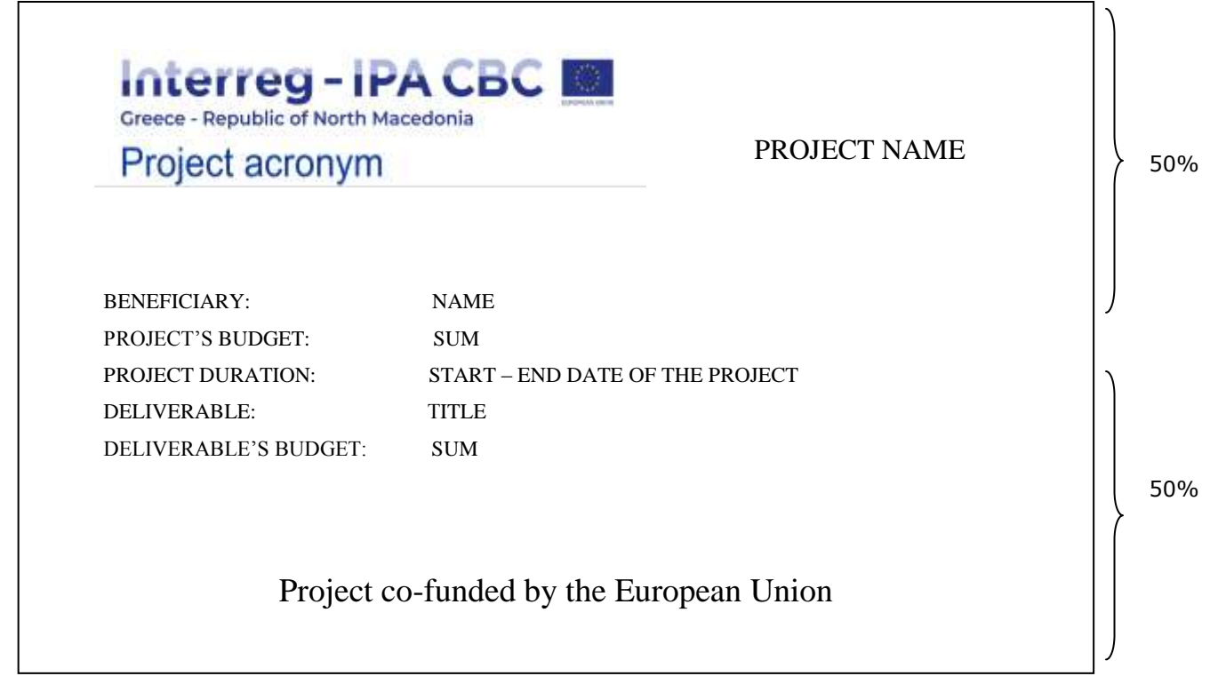
Picture 6: Information sign/ Billboard/Permanent Explanatory Plaque template